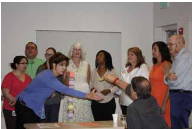
A Human Services Information Network meeting exercise

United Way 211 serves as the coordinator of the meetings of the Human Service Information Network and produces a directory of services available in Lee, Hendry, and Glades Counties. United Way 211 hosted 12 Human Service Network meetings with over 1,000 professionals attending . This meeting provides both an educational & networking opportunity to health and social service professionals.