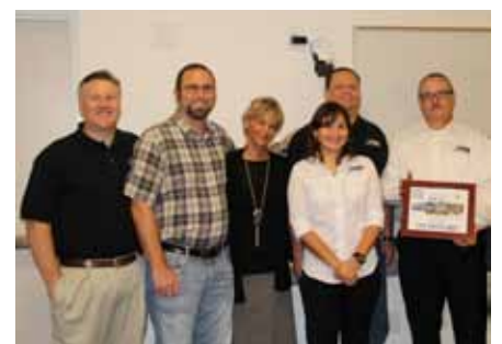
Turbine Generator Maintenance, Inc.