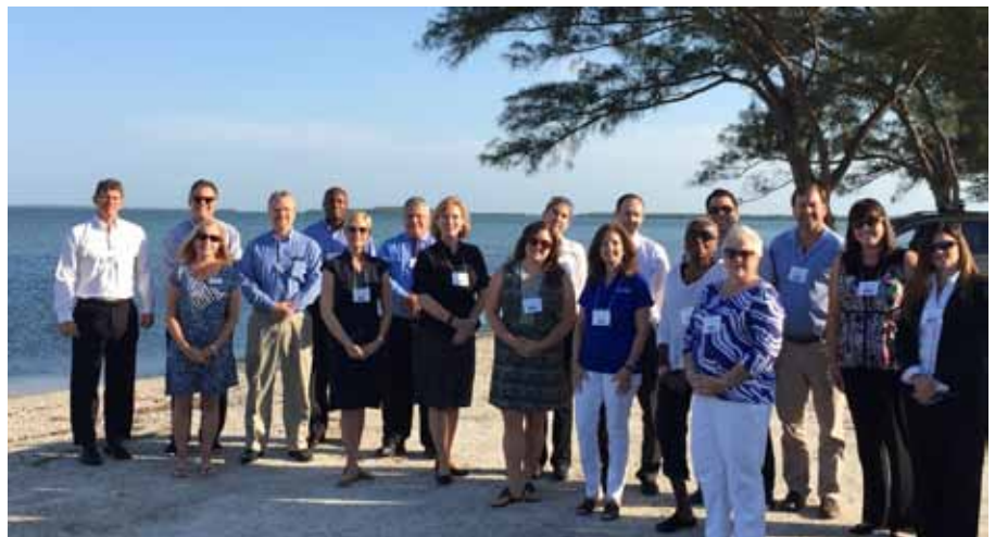
Lee County Allocations Team 1