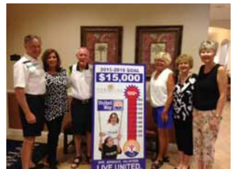
Colonial Country Club