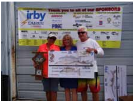
LCEC Fishing Tournament