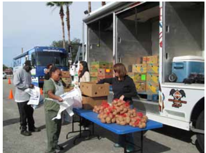
Food Distribution in Clewiston