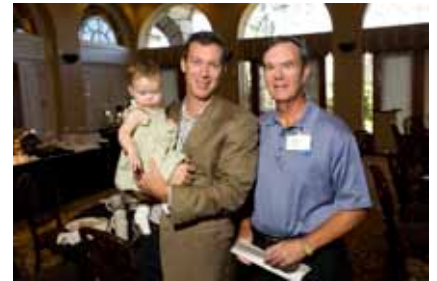
Bonita Bay Group