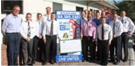
Publix Super Markets

Hundreds of companies and organizations conduct employee campaigns, or make corporate donations every year. A number of companies match employee contributions giving great power to an individual's gift to the United Way. Companies contributing $100,000 or more receive Circle of Excellence awards. The following companies and organizations are recognized for contributing $1,000 or more to the 2015-2016 United Way of Lee, Hendry, Glades, and Okeechobee Campaign.