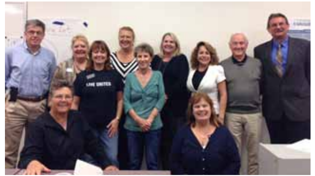
Family Mentor volunteers first graduating class.