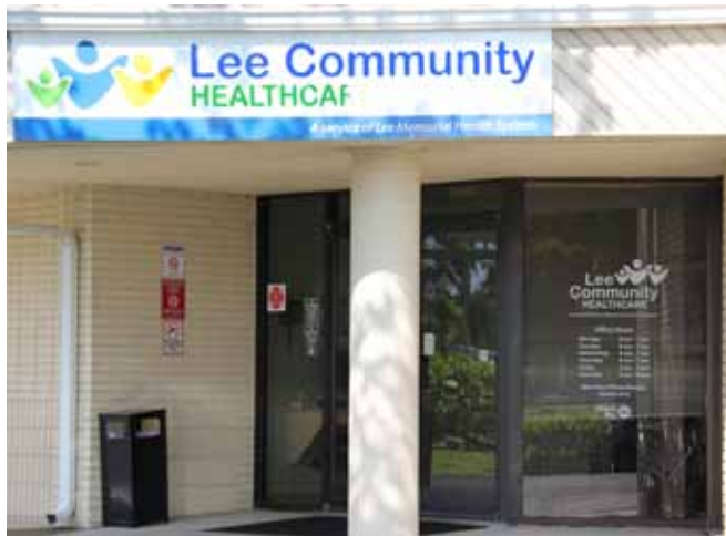
Lee Community Healthcare North Fort Myers

3,419 families had minor children 2,370 families with children ages 0-8 years 443 families with concerns 207 families connected to Healthy Start and the network of providers