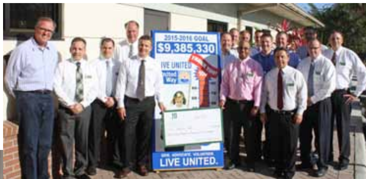
Publix Super Markets Store & Regional Managers

THANK YOU PUBLIX & ASSOCIATES FOR RAISING $1,726,249!