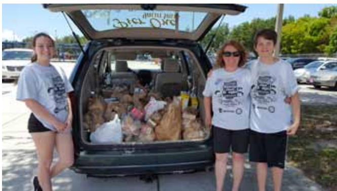
Volunteers at Cape Coral Post Office