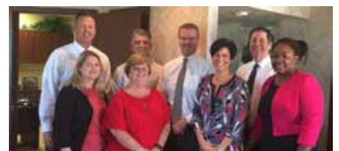
BB&T Oswald Trippe & Co.