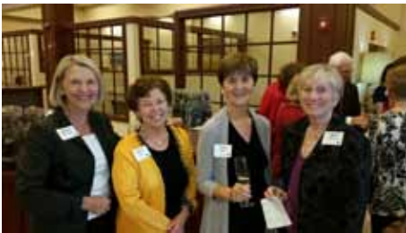
Bonita Bay Community

Many communities in Southwest Florida form United Way Community Campaign Committees to raise money for the United Way. The campaign committees conduct events such as golf and tennis tournaments, dinner dances, and many more imaginative events to have fun giving to the United Way of Lee, Hendry, Glades, and Okeechobee.