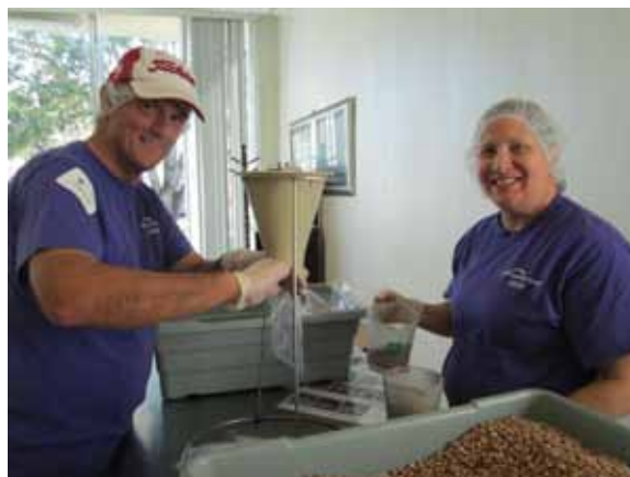
Lee Memorial Health System employees packing food for Harry Chapin Food Bank.