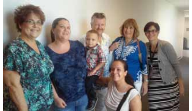
A successful reunification.