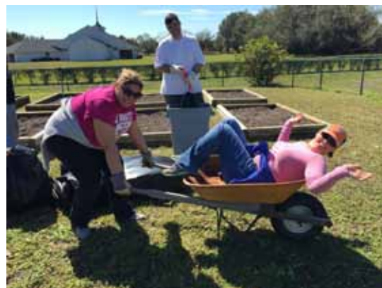
City of Cape Coral employees planting a vegetable garden for Lifeline Family Center.