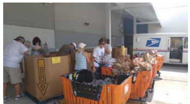
Sorting at 6 Mile Cypress Post Office