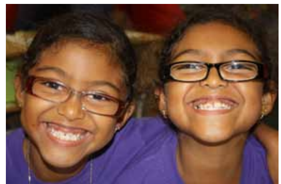
Gladiolus Learning & Development Center