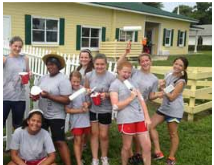
Real Life Children's Ranch

American Red Cross Big Brothers Big Sisters Castle Children's Home Society of Florida Early Learning Coalition Hibiscus Children's Center Hospice of Okeechobee Martha's House My Aunt's House Okeechobee Educational Foundation Real Life Children's Ranch Shared Services Network of Okeechobee Treasure Coast Food Bank 211 Palm Beach/Treasure Coast