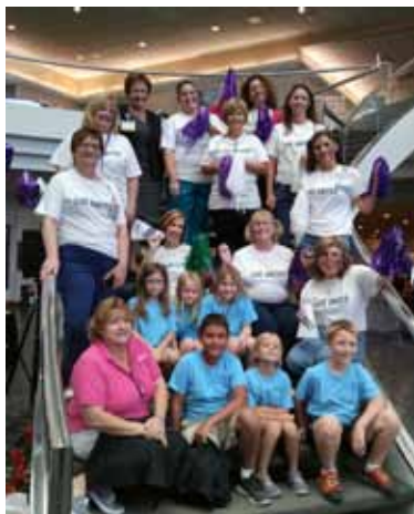
Lee Memorial Health System