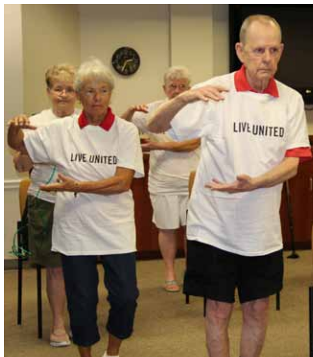
Hope Healthcare's Parkinson's program Tai Chi Class.

NAMI Lee County New Horizons of Southwest Florida Our Mother's Home of Southwest Florida (OMH) PACE Center for Girls, Lee Partners for Breast Cancer Care Quality Life Center of Southwest Florida SalusCare Scholars Program/Florida Gulf Coast University Social Norming - The School District of Lee County Southwest Florida Regional Human Trafficking Coalition Special Equestrians The Bonita Springs YMCA The Fort Myers YMCA The Heights Center The Salvation Army United In Kind United Way 211 United Way Reading Pals United Way VITA United Way Volunteer Center