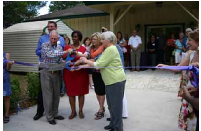
The new ACT Shelter in Hendry County

Abuse Counseling and Treatment (ACT) Agape Home Alvin A. Dubin Alzheimer's Resource Center American Red Cross Florida's Southern Gulf Region Big Brothers Big Sisters of the Sun Coast Boy Scouts of America, SW Florida Council Catholic Charities of Lee, Hendry & Glades Counties Child Care of Southwest Florida Children's Advocacy Center of SW Florida Children's Network Crossroads Girl Scouts of Gulfcoast Florida Good Wheels Goodwill Industries of Southwest Florida Harry Chapin Food Bank of SW Florida Healthy Families Healthy Start Coalition of Southwest Florida Hendry County Schools Educational Initiative Hope HealthCare Services Lighthouse of SWFL Literacy Council Gulf Coast NAMI PSEP/Scholar's Programs, FGCU RCMA The YMCA The Salvation Army United Cerebral Palsy United Way 211